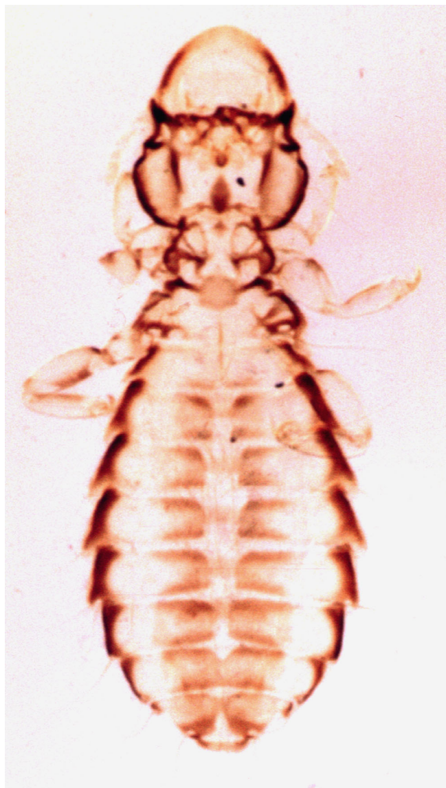
Figure 3. Chicken head louse.