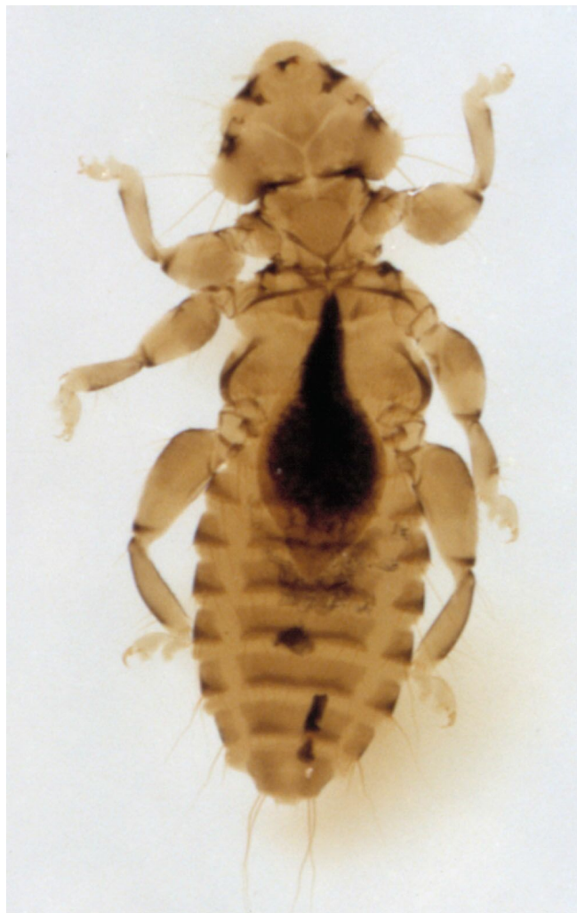
Figure 1. Shaft louse.

The shaft louse (Figure 1) is the most serious louse pest of chickens. It feeds on the barbs and scales of the feathers, causing little host irritation. It is usually not found on young chickens because of their lack of well-developed wings. The adults, nymphs and eggs are found on the feathers and generally damage the plumage. The shaft louse also will infest ducks, turkeys and guinea hens if they are housed close to infested poultry.