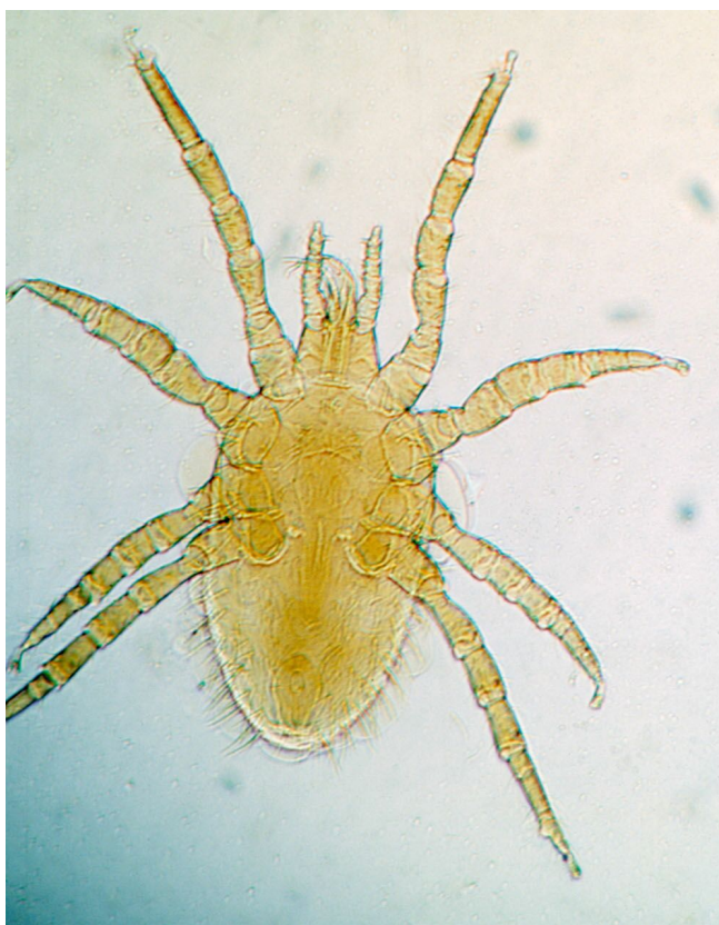
Figure 6. Tropical fowl mite.

The tropical fowl mite (Figure 6) is widely distributed in South America, the Caribbean and southern United States. It is a mobile species and will feed during the day or night. Besides domestic fowl, the tropical fowl mite prefers English sparrows and transmission from wild birds to domestic fowl are quite common.