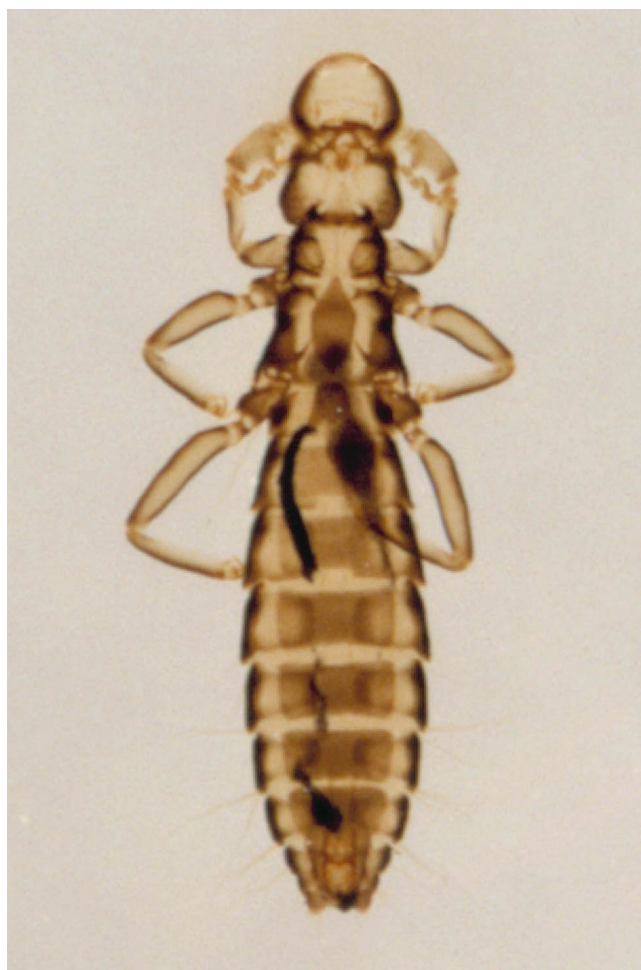
Figure 2. Wing louse.

skin are made bare. Infested birds commonly scratch themselves with their claws, causing intense irritation.